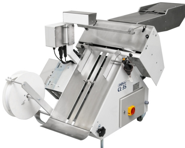
Optional equipment for CL-35

The bags are sealed by a clip-closing band, which is of plastic stiffened with steel wire in both edges. The clip width is 8 mm and for one closing the required length is approximately 50mm.